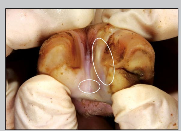
Vesicle in interdigital area and swollen coronary band