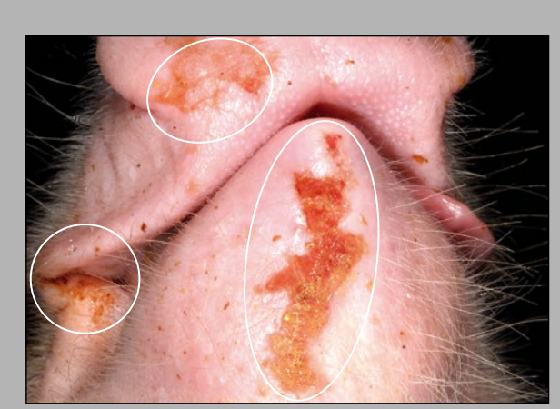
Erosion with fibrin deposition