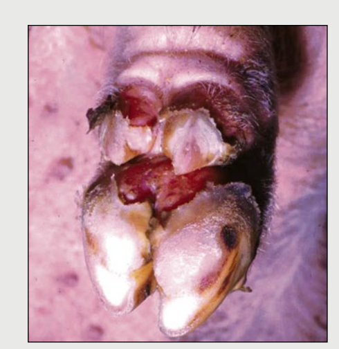
Sloughing of claw