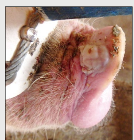
Vesicular lesions on the snout