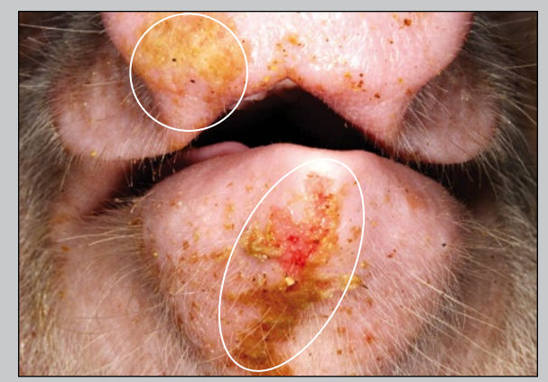
Erosion of lower lip and snout with fibrin