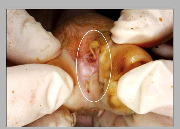
Interdigital ulceration at coronary band