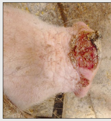
Large erosion on the snout