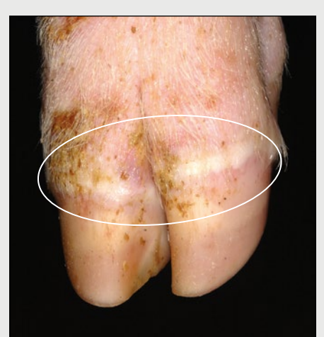
Blanching of the coronary band