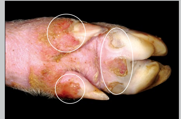
Ulcerations and erosions from ruptured vesicles