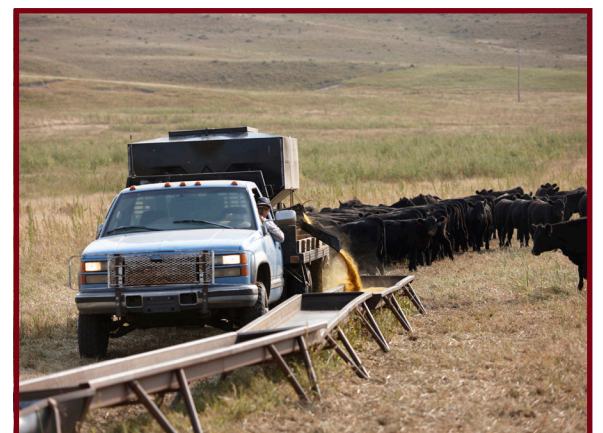
Handle and feed young animals before older animals, leaving sick or treated cattle until last to limit disease spread; or use dedicated equipment and personnel for each group.