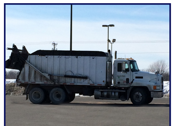
Ensure carcass disposal plans follow local and state regulations to prevent environmental contamination. Prevent the rendering truck from sharing drive paths with on-site vehicles or passing near live cattle to limit disease introduction. Protect carcasses from scavengers that can spread disease.