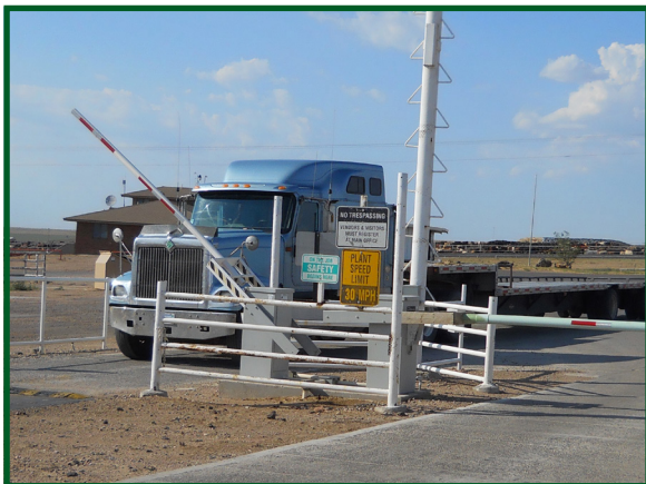
Identify and clearly mark a "Line of Separation" (LOS) between on-site and off-site movements and activities. Inform those who need to cross the LOS of the required biosecurity protocols.