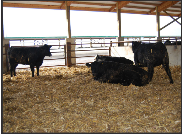
Incoming cattle can introduce disease to the herd of origin unless quarantined and managed separately for a period of time. Observe, test, and vaccinate as recommended by your veterinarian.