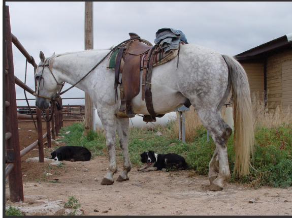
Four wheels or four legs (dogs, horses) used to move cattle can carry disease agents on tires, paws, hooves, collars or tack. Minimize spread by working cattle from youngest to oldest and sick last.