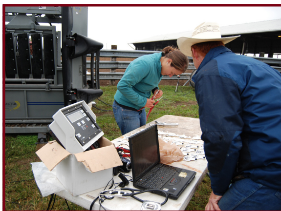
Keep records of animal identification numbers, vaccinations, and treatments given, at a minimum. In a disease outbreak, records of all animal, vehicle, and people movement onto and off of the operation should be kept.