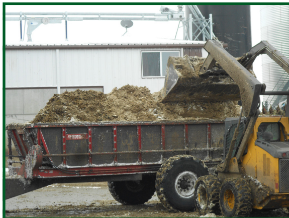
Dedicate equipment to your operation and task whenever possible. Avoid using the same equipment for handling manure, dead animals, and feed unless it is thoroughly cleaned, disinfected, and allowed to dry after use.