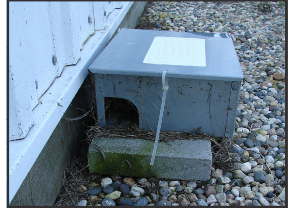
Unwanted wildlife, rodents, and insects can spread a variety of diseases to cattle; utilize integrated pest management programs.