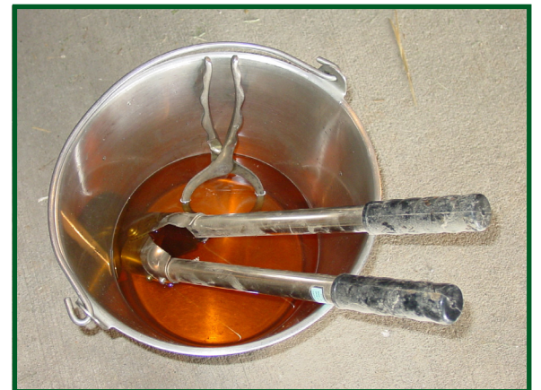
Instruments or equipment contacting blood, tissues, used in the mouth, or treating sick animals should be cleaned and disinfected between animals of different health status.