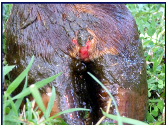
Recognize and examine sick and lame cattle early and immediately report any vesicles on cattle to animal health authorities. This lame cow had a ruptured vesicle between her toes caused by Foot and Mouth Disease (FMD).