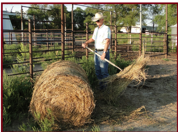
Wear clean work clothing that has not been around animals on other operations and footwear that can be cleaned when moving between different animal groups.