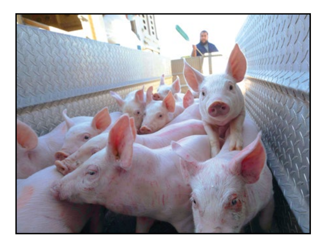
Respect the line of separation. Farm personnel and equipment stay on the barn side. Drivers and loading equipment stay out of the barn.