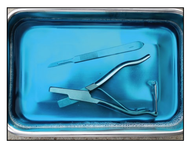
Thoroughly clean and disinfect equipment between pigs or groups. Keep items in disinfectant for full contact time and allow to dry.