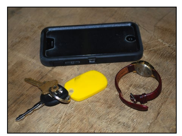
Do not bring personal items into the farm without approval. All items must be disinfected prior to entry.