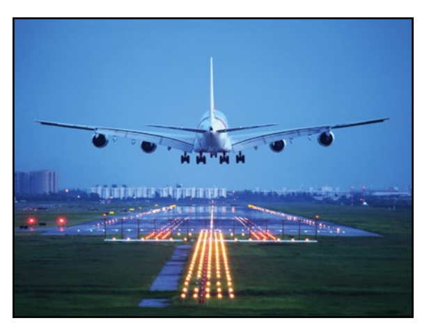
Follow the farm downtime policy after international travel. A period of downtime or extra biosecurity measures may be needed.