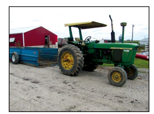
Do not share equipment between sites. If this is absolutely necessary, clean, disinfect, and allow the equipment to dry before reuse.