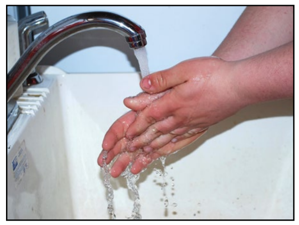
Wash hands before and after entry or during shower-in/shower-out. Follow all farm entry protocols and respect the line of separation.