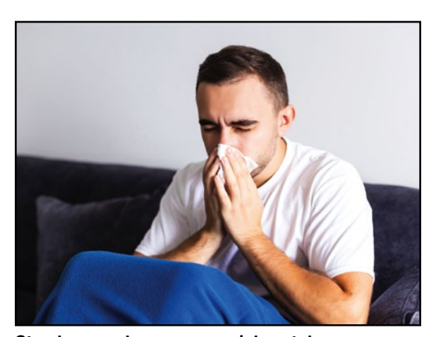
Stay home when you are sick or take measures to prevent the spread of diseases from people to pigs. Follow farm policy for sick leave.