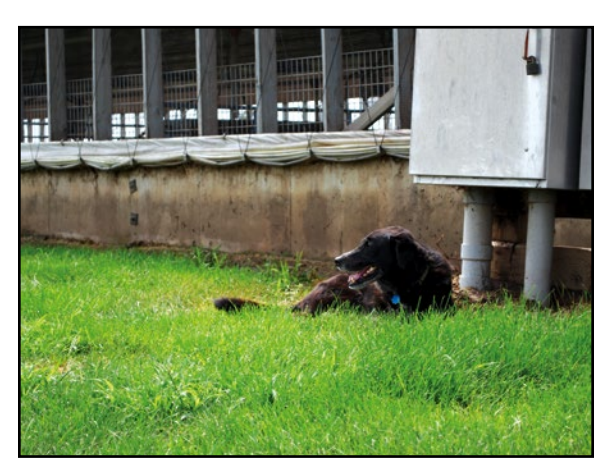
Keep pets and other animals out of hog buildings to avoid potential spread of diseases