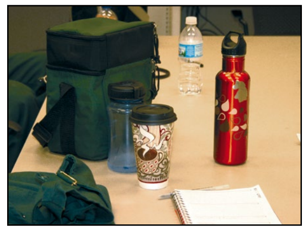
Do not eat or drink in animal areas. Keep food in a breakroom or office.