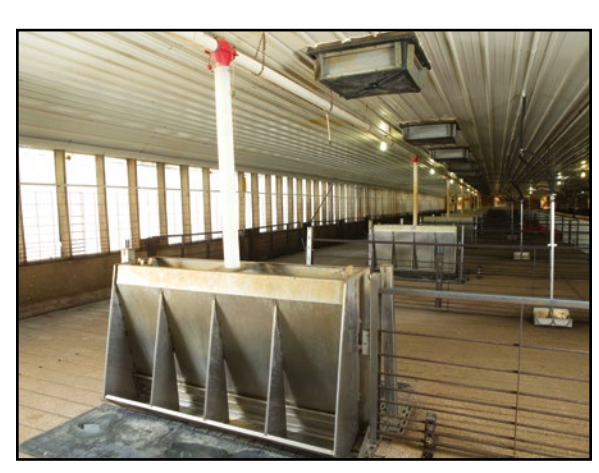
Thoroughly clean, disinfect, and dry the facilities between groups of pigs.